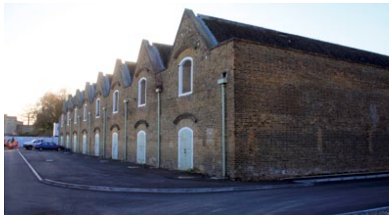
'B' Magazine now converted into office accommodation.

The poor performance of the Ordnance Board during the Crimean War saw its eventual abolition and most of its duties transferred to the War Office. It also brought the inadequacies of storage provision on the Upnor site to a head, a situation compounded by the fact that filled shells could not be kept in the same magazine as gunpowder: shells were carried through the Laboratory, where gunpowder was being examined and filled into cartridges, and then hoisted twenty feet into an adjacent chamber. In 1856 the decision was made to build a new shell store and magazine, the latter with a capacity of 23,000 barrels. These were completed in 1857 and an additional shell store was built in 1860–61. However, by this time the expansion of the Royal Navy in general and Chatham Dockyard and its defences in particular had further increased the demands on the Upnor Depot so