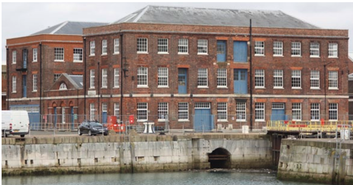
The Portsmouth Block Mills (1802).