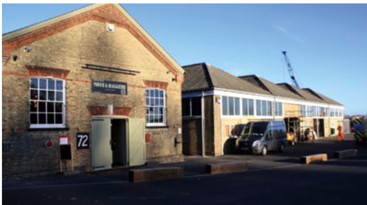
The Filled Mine Store (now a café) and the Filled Shell Store (now office accommodation).