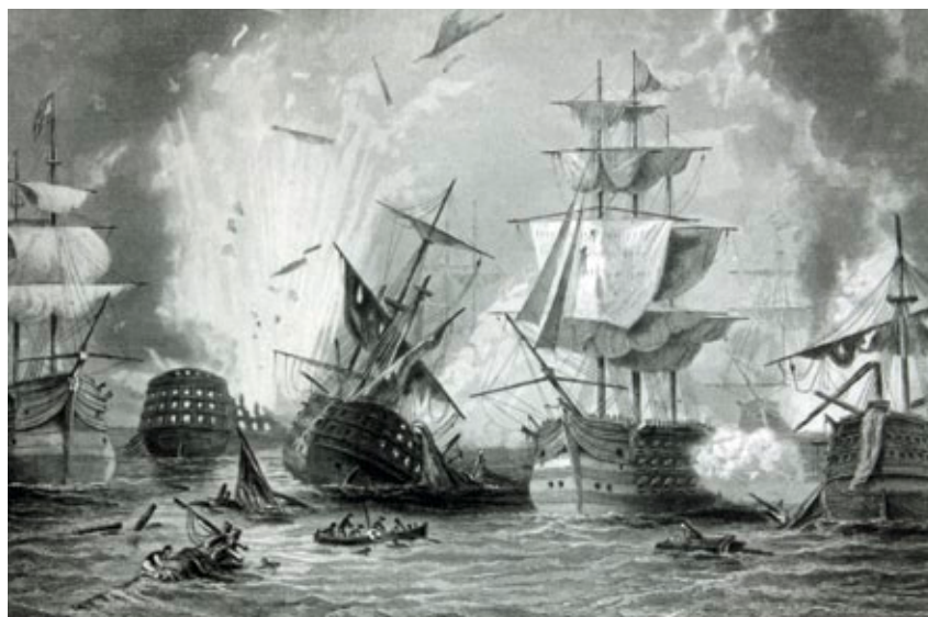
The Battle of Navarino, 1827.

year) were paid, where the deceased had had at least ten years' service. Records also showed the considerable amount of ordnance carried by transports, they might take up to twenty working days to unload. Or did this reflect a degree of inefficiency!