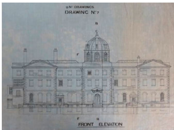
Above: 2–8 The Parade (1715–19). Above left: The former Royal Naval Academy (1730–34). Left: Refurbishment plans at the National Archives (Work 41,1905).