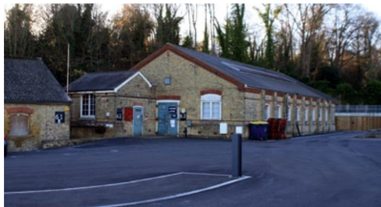
From left to right: Fuze & Tube Store; Mine Testing Room and the Wet Gun Cotton Store.