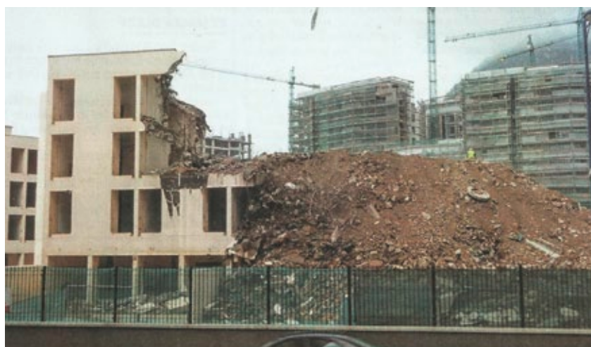
HMS Rooke .

Close to No. 4 Dock is the former Royal Navy headquarters building, HMS Rooke , handed over to the Gibraltar government in October 2016 after a seventy-year history. The 1970s buildings on this site are now being demolished.