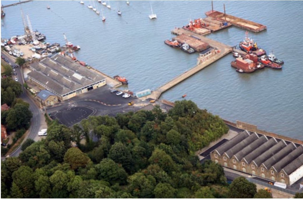
Aerial view of the Lower Ordnance Depot from 2016.

Structures visible: on the left the Filled Mine Store and the Filled Shell Store; in the centre are the remains of the Ordnance Pier Network and on the right is 'B' Magazine.