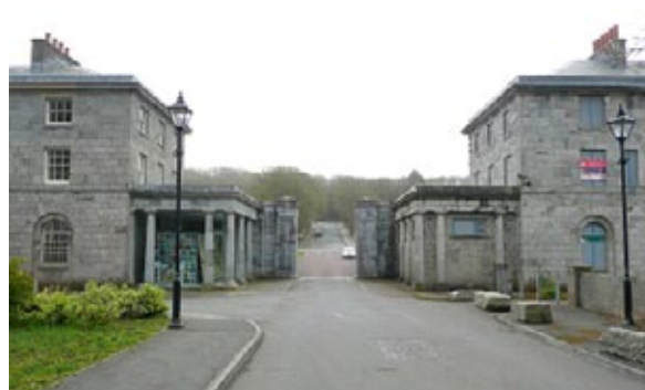
The entrance to Pembroke Dockyard, c.1900 and today.