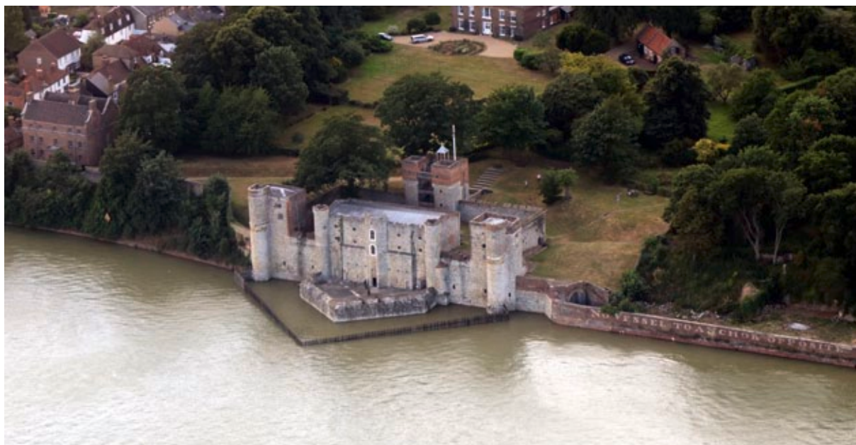
Aerial view of Upnor Castle with the 1719 barracks house to the left and the ordnance depot river wall to the right. Note the lettering on the wall warning ships not to 'ANCHOR OPPOSITE' in case of any accidental explosions at the depot.

yard. It rapidly expanded with the building of a new quay, cranes, workshops, a dry dock and officers' accommodation. The new dockyard still relied on Upnor Castle for its defence. However this reliance was found to be seriously misplaced during the second Anglo-Dutch War in 1667, when the Dutch fleet sailed up the Medway, broke the chain across the river below Upnor and attacked the English fleet. The castle's obsolete guns lacked the range to bring the Dutch ships under effective fire. A hastily constructed new eight-gun battery was established near the castle, which prevented the Dutch advancing any further up-river but not before they had caused severe damage to the English fleet and seized and carried off its flagship the Royal Charles back to Holland as a prize.